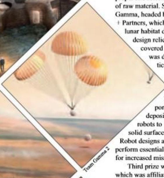
Team Gamma 2